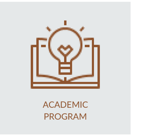
AREAS OF ENGAGEMENT